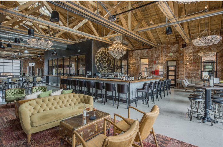
Bigsby's Folly is a great place to gather with family, friends, and co-workers. With over 7,000 square feet and 6 distinctive event spaces, Bigsby's is the ideal setting to comfortably accommodate groups from 10-450 guests. In order to provide the best possible service, we ask that you contact us in advance so we can ensure we have the space and staff to accommodate your group. A completely customized experience awaits with our unique wine list, full bar and food menu options.